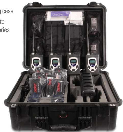
BioHarness Team Kit

BioHarness is a trademark of Zephyr Technology