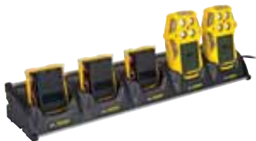
Multi-Unit Cradle Charger QT-C01-MC5 Simultaneously charge five detectors and/or batteries