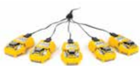
Multi-Unit Power Adaptor GA-PA-1-MC5-NA* Simultaneously charge five detectors and/or batteries