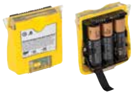
Rechargeable / Alkaline Battery Packs QT-BAT-R01 / QT-BAT-A01